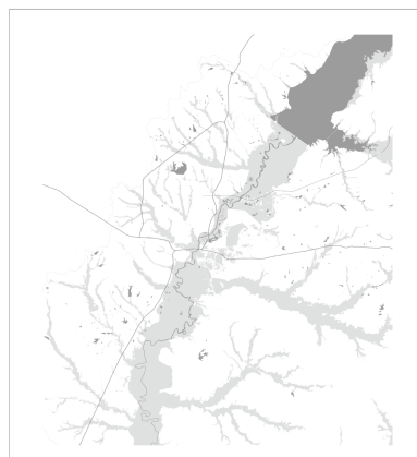
FEMA floodplain map